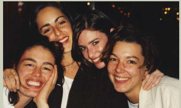
with friends in New York